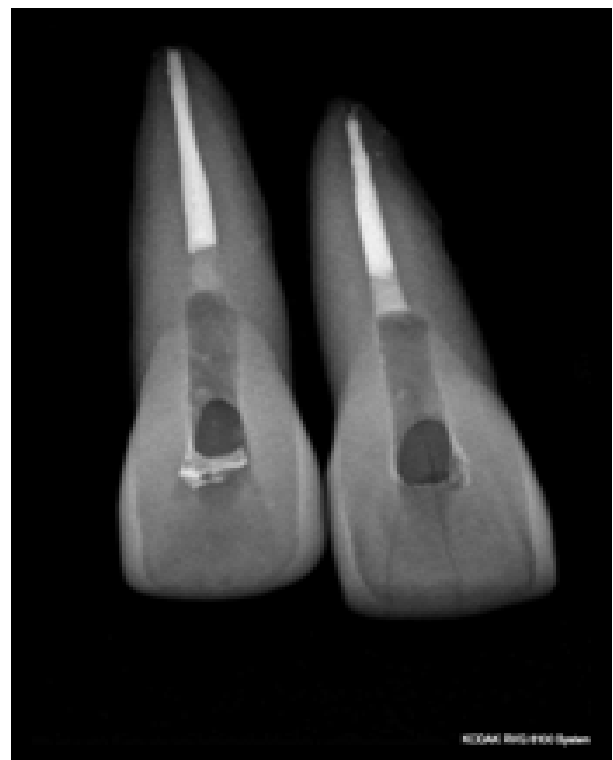
Fig. 1: Radiograph of maxillary centrals obturated with gutta-percha & AH plus sealer and 2mm GIC barrier.

Following standardized endodontic protocol, access cavities were prepared on the palatal surfaces of all the teeth using Endo Access bur (Dentsply). Working length was established by inserting a #15 k file (MANI) into the root canal until the file tip was just visible at the level of the apical foramen, and the distance between file tip and the rubber stop representing actual tooth length was measured to the nearest tenth of a millimeter. Working length was determined as 1mm short of the actual tooth length.