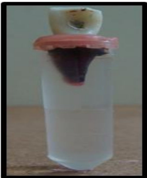
Fig. 2: Mounted teeth with radicular portion including CEJ immersed in distilled water.

All the bleaching agents used in this study showed peroxide penetration from radicular canal following intracoronary bleaching (Table1, Fig.3). Highest mean peroxide penetration (in µg) was observed from Group 3 (30% hydrogen peroxide) (4.40µg/ml) followed by Group 4 (2.68µg/ml), Group 2 (1.48µg/ml) and least from group 5 (10% carbamide peroxide gel) (0.32µg/ml) (Table1). The difference in mean peroxide leakage between the groups was found to be statistically significant ( P < 0.001 ) using ANOVA. Multiple comparisons (Post – Hoc tests) done using Bonferroni test also showed significant difference among the groups. No radicular peroxide penetration was observed in Group 1(control).