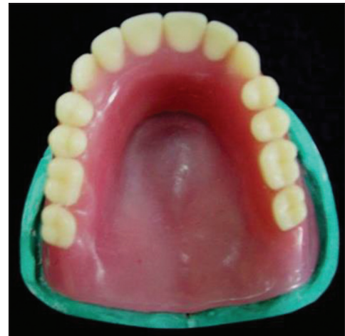
Figure 4: Processed denture with putty spacer inside.

Bone resorption starts just after total teeth extraction from there it is a continuous process. 5 It is difficult to predict the individual variation in the rate of resorption. Even now it is less understood because of its complex etiology. It is strongly