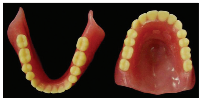
Figure 6: Windows closed with autopolymerizing resin.