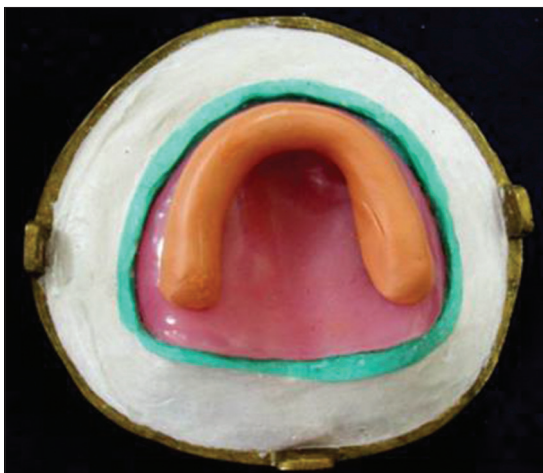
Figure 2: Silicone putty spacer adapted.