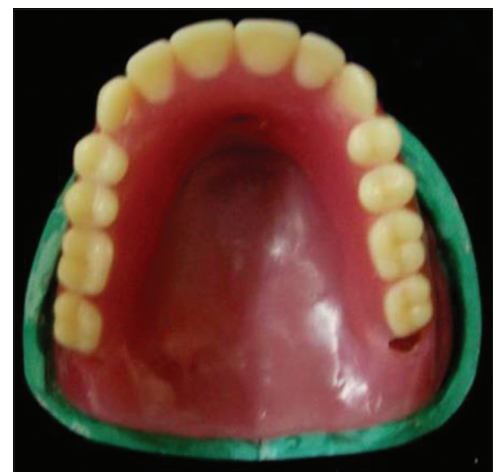
Figure 5: Windows created to remove the silicone putty spacer.