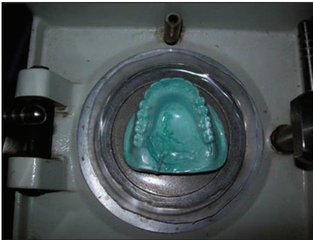
Figure 1: Duplicated cast of trial denture with clear matrix adapted.

complete denture. 3 The heavy and light weight mandibular complete denture was compared with the retention, stability, and comfort. It was showed that the retention or stability was not affected by the metal base, which was used to increase the weight of the mandibular denture.