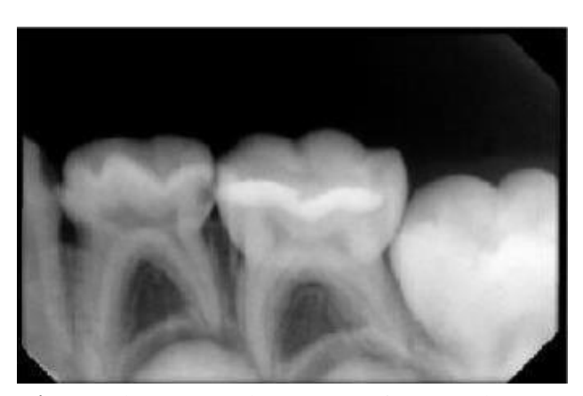
Fig 5: Radiovisiographic image of proximal caries.

using hand instrument i.e spoon excavator(API) (figure 3) Before starting the treatment, teeth were selected radiographically using RVG (Digital radiovisiography). and these were scored according to the radiographic criteria; [Ekstrand et al (1997)4 criteria for occlusal caries (fig 4) and Mialhe et al (2009)<sup>5</sup> for proximal caries(fig 5) ]. The selected tooth was isolated using rubber dam. Caries detecting dye (Caries Detector) containing 1% acid red in propylene glycol was applied using an applicator tip and was washed with water. After the caries was removed by using different