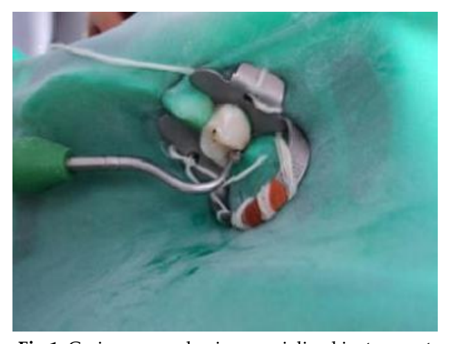
Fig 1: Caries removal using specialized instrument & Carisolv gel.

The profession is slowly progressing from "finding and filling" to "early detection and management". Dentists adopting this treatment philosophy have fewer cavities to fill and more surfaces to save. The concept of minimal intervention dentistry not only eliminates the pain associated with the removal of caries but also instills a positive attitude in children towards dentistry<sup>2</sup>. The chemico-mechanical caries removal system "Carisolv", has been developed with the purpose of removing all the infected tissue, preventing the removal of sound dentin, is intended not to cause discomfort to the patient and is based on biological principles<sup>3</sup>. The treatment is quiet and comfort .The Present investigation aimed to evaluate and compare the chemico-mechanical caries removal with that of