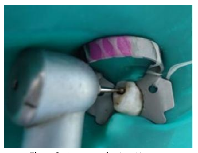
Fig 2: Caries removal using Air rotor.

conventional means with respect to efficacy of caries removal, caries removal time, reported pain severity in deciduous molars with moderate dentinal involvement.